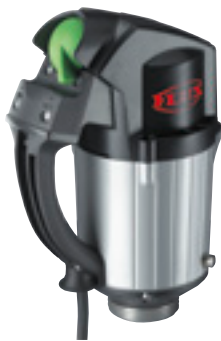
F 460 Ex (HT)

Both our motor F 460 Ex (HT), as well as our 400 series explosion proof (HT) stainless steel pumps are certified by the National Metrology Institute (PTB) for applications in hazardous areas with higher ambient temperature of up to 60 °C.