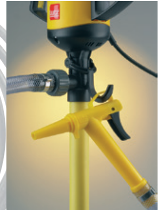
Hook for storing nozzle and power cord at the pump

The perfect solution to transfer small amounts of liquid